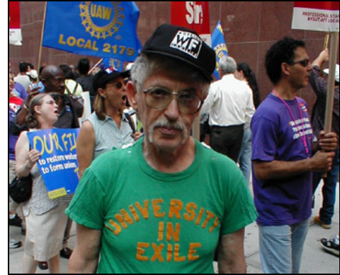
Rally in support of the right to unionize July 1 2004