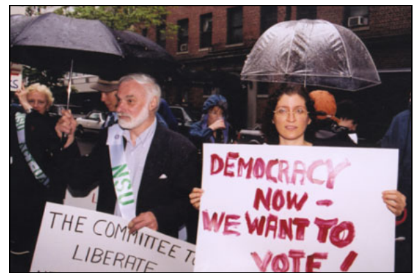
The New School Rally