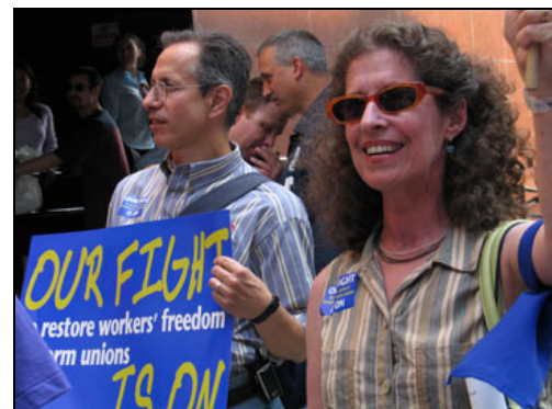
Rally in support of the right to unionize July 1 2004