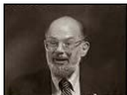
Do you know who this man is? Answer on page 19

Let's return to the American scene as a whole. What is it? It is the hemisphere and all its nations, with their long histories of capital, commodity, and human flows. It is the global reach and destructive force of U.S. geopolitical might, U.S. military force, and U.S. capital — all of them converging to bring war to many areas, and to increase global inequality. And it is the global reach of U.S. cultural commodities — film, television, celebrities — that provoke both longing and disgust at home and abroad. It is a rapidly shifting, working-class majority, multiracial nation with the New Right in power, and feisty but weakened labor, civil rights, civil liberties, feminist, gay, and environmental movements—It is also a corporate-controlled but always shifting Babel of media narratives, narratives explaining, misrepresenting, rationalizing — but also protesting against, dissenting from the status quo. And we are contributing to those narratives, to the best of our abilities, as anthropologists — singly, as teachers, researchers, and writers -- and jointly, as members of the Justice Action Network of Anthropologists and as citizen activists in a wide array of movements. As Allen Ginsberg ended his wonderful McCarthy-era poem, "Howl," "America I'm putting my queer shoulder to the wheel."